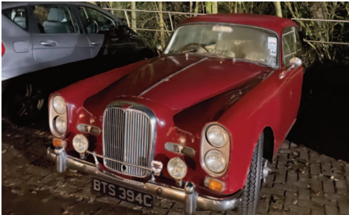
As I said last month - if there's only one Alvis in the car park you know whose it'll be!

We had our first venture out in the hope of finding a new home that suits our needs following the closure of our beloved Deanwater. This was held at the Stanneylands Hotel, which, I think, is quite acceptable and has potential that we can build a relationship over time. However I have had mixed comments about the new venue so we'll see! that sloping car park is going to be a challenge for anyone opening or closing the door on a TD, TE or TF! - B'er T'er.